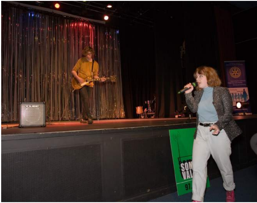
2nd Place - and a cash prize of £200 went to duo GUTS